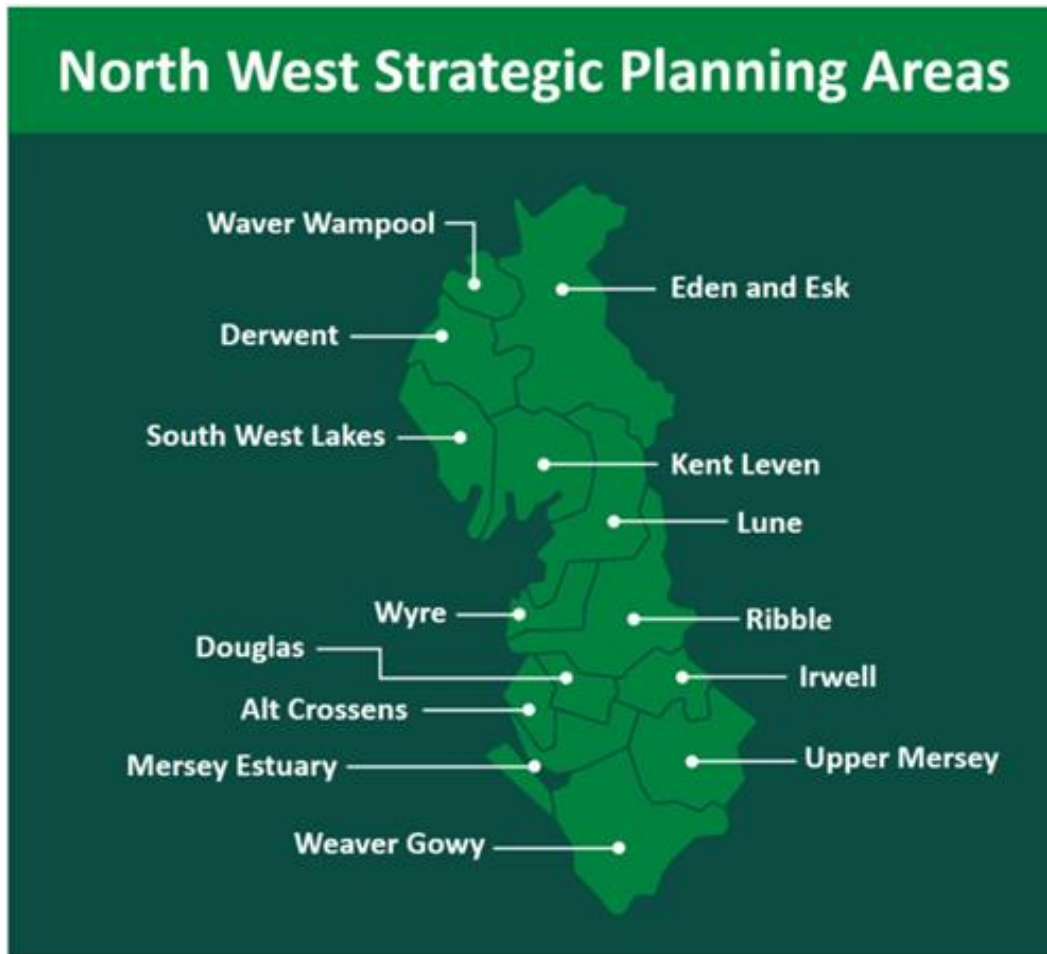
Figure 2.2 United Utilities Water 14 Strategic Planning Areas

2.2.5 Following the completion of the RBCS and BRAVA process, UUW has identified 372 TPUs where drainage, flooding, pollution and treatment risks have been identified. A limited number (26) of these TPUs are characterised as being either 'complex' or 'strategic'.