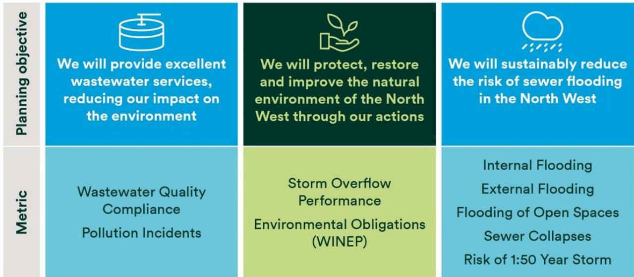
Figure 2.1 U UW DWMP Planning Objectives

2.2.4 In developing the DWMP, and consistent with the approach outlined in the Framework, U UW has identified that the plan will operate at the following spatial levels: