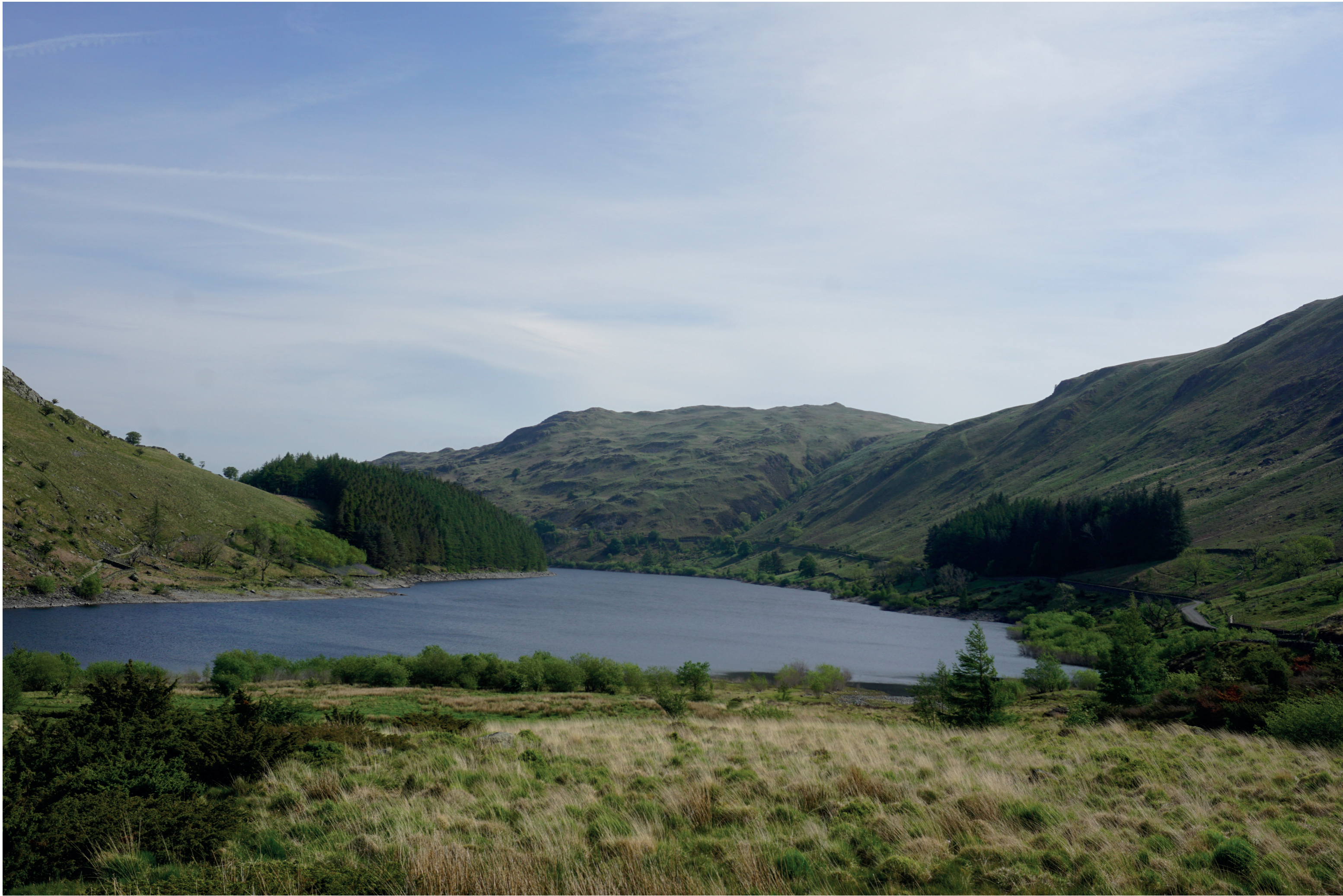
View 3: Existing Condition