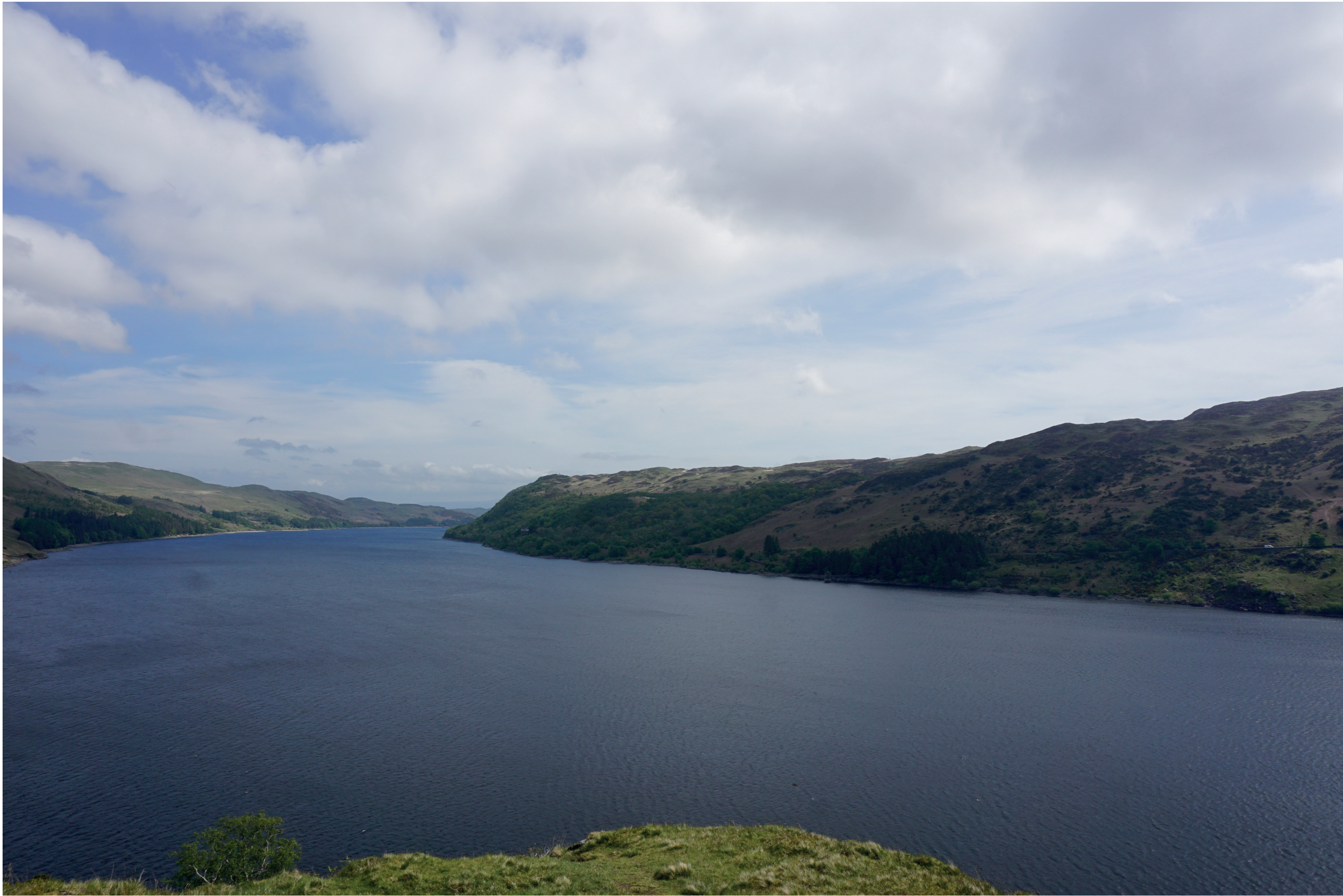
View 2: Existing Condition