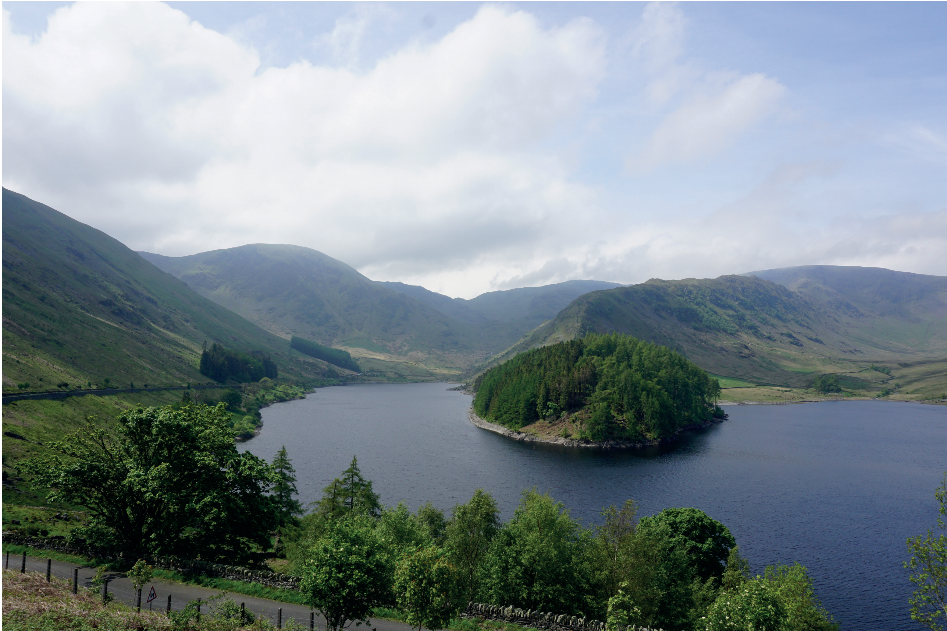
View 1: Existing Condition