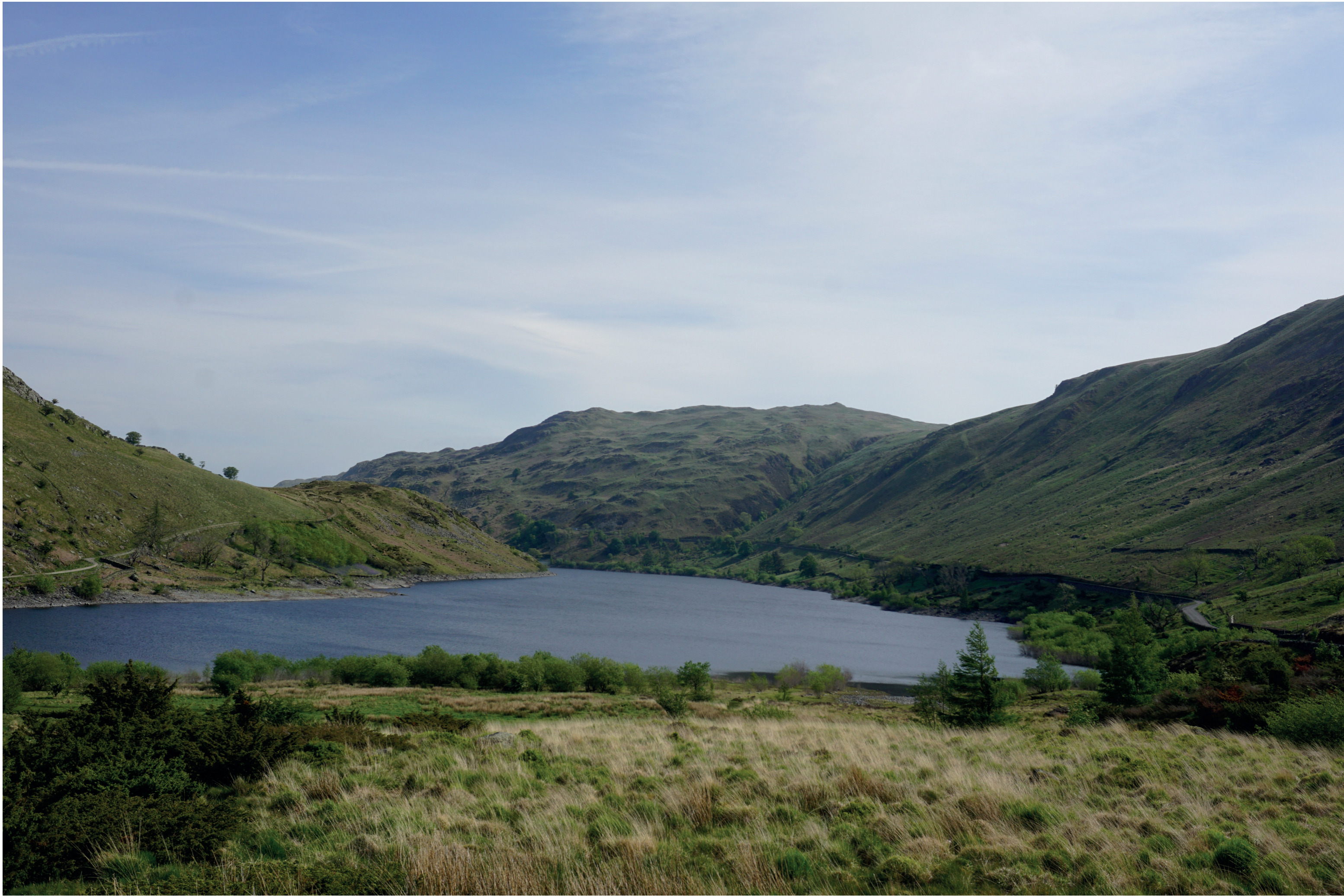
View 3: Year 5

Artistic Impression. For information only.