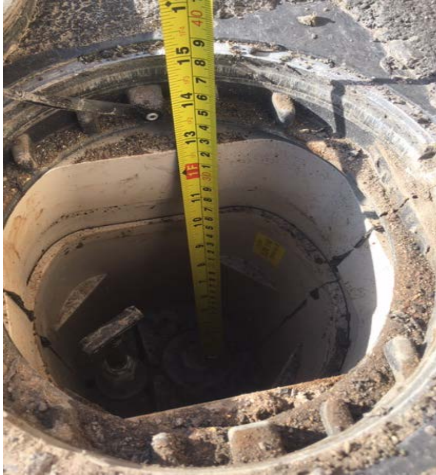
Internal meter install poor practice