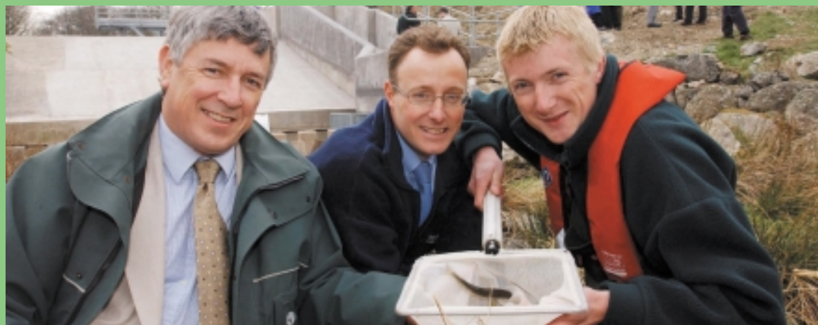
Sir John Harman, chairman of the Environment Agency, officially opens Heltondale fish pass. The scheme is part of the capital investment programme to improve flows and fish stocks in Cumbrian rivers.

Deferred tax is £62.9 million in 2002/03 compared with £6.1 million in 2001/02. The increased charge in 2002/03 is primarily due to the effects of lower gilt interest rates on the discount of the full potential liability.